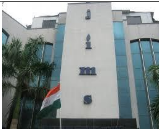
Jagannath International Management School OCF, Pocket-9, Sector-B, Vasant Kunj, New Delhi