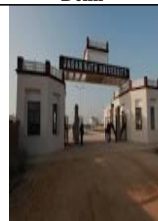
Jagannath University BahadurGarh (Haryana)