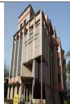
Jagannath International Management School MOR, Pocket 105, Kalkaji, New Delhi