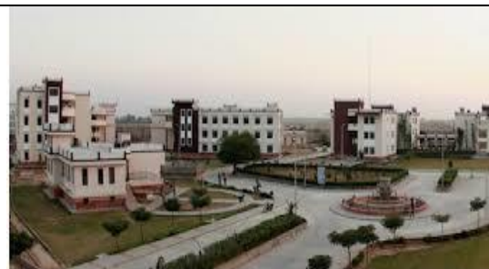
Jagannath University Village Rampura, Tehsil Chakshu, Jaipur (Rajasthan)