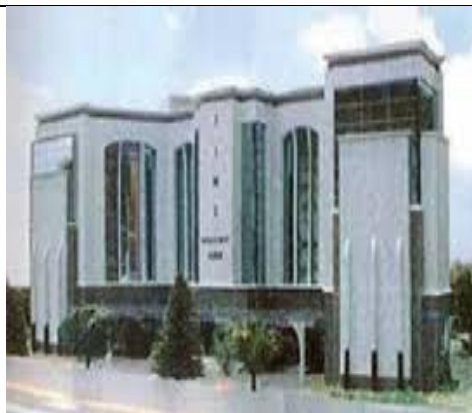
Jagannath Institute of Management Sciences JIMS Vasant Kunj-II, Plot no- 3, Institutional Area, Phase -II, Vasant Kunj, New Delhi- 110070