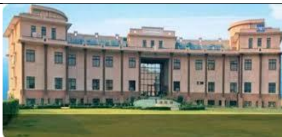
Jagannath Gupta Institute of Engg. & Technology Plot No. IP 2 & 3, Phase-IV, Sitapura Indl. Area, Jaipur (Rajasthan)