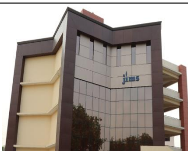
Delhi Institute of Higher Education Plot No. 20 C, Techzone – IV, Noida Extension (U.P.)