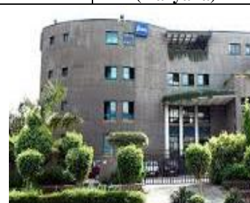
Jagan Institute of Management Studies 3, Institutional Area, Sector-5, Rohini, New Delhi