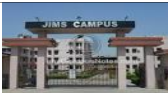
JIMS Engineering Management Technical Campus Knowledge Park-III, Greater Noida, U.P.